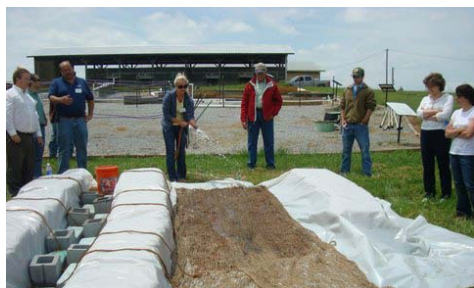
Tour #2- Erosion and Sediment control demonstrations.